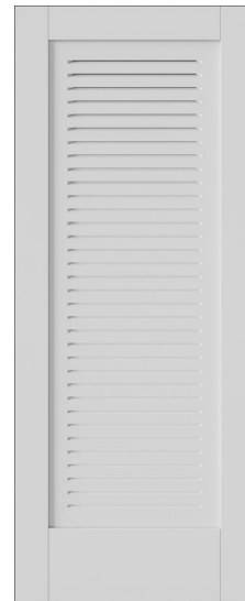
K-6000 1-PANEL VENT