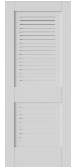
K-4010 2-PANEL VENT/VENT